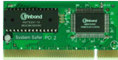
Top Side EEPROM 20g

Product Identifier : PCI 2EEP ROM IC : • EEPROM, 32KB, DIP-32Pins. Card Size : W79.20mm H41.20mm D12.00mm(max). Card Weight : 20g. Top Sticker : NULL.